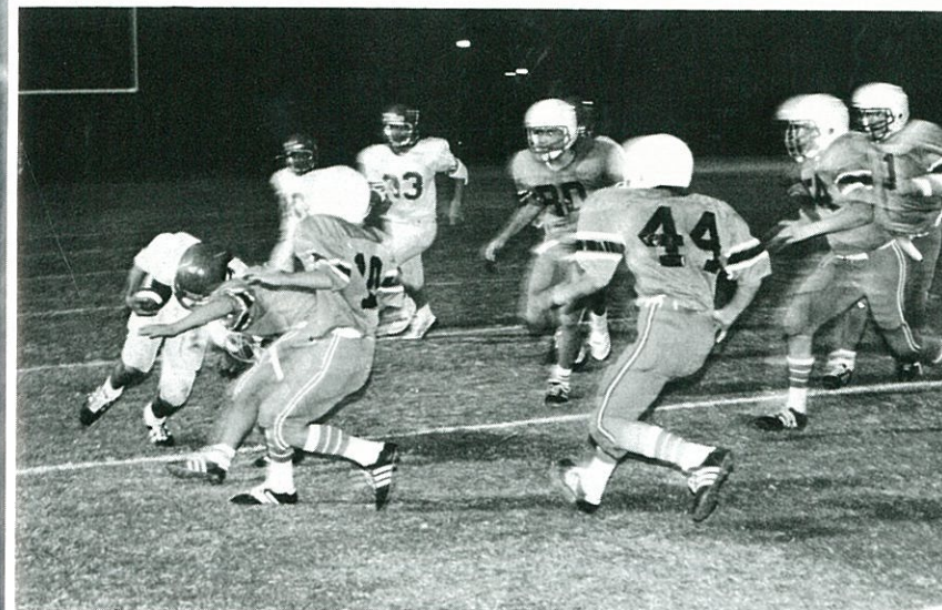
Wildcats surround the opponent. This held them to a short gain.